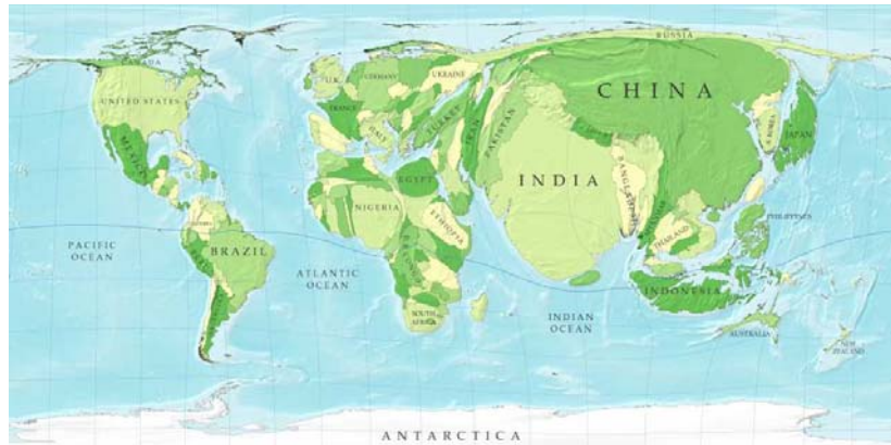
Fig. 1.3. Visualization of world map areas scaled proportional to size of population by country.

visual representations to facilitate thinking, understanding, and knowledge construction about geospatial data” [513] or as “the use of visual geospatial displays to explore data and through that exploration to generate hypotheses, develop problem solutions and construct knowledge” [473]. Chapter 6 surveys the most important geovisualization techniques and methods, shows frequent problems, and in this context also discusses human-centered issues, such as usability and quality assurance by means of user studies.